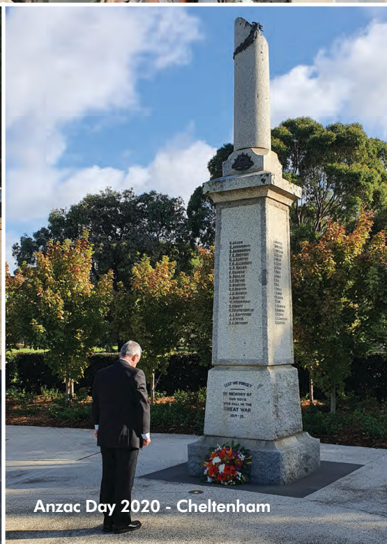
Anzac Day 2020 - Cheltenham