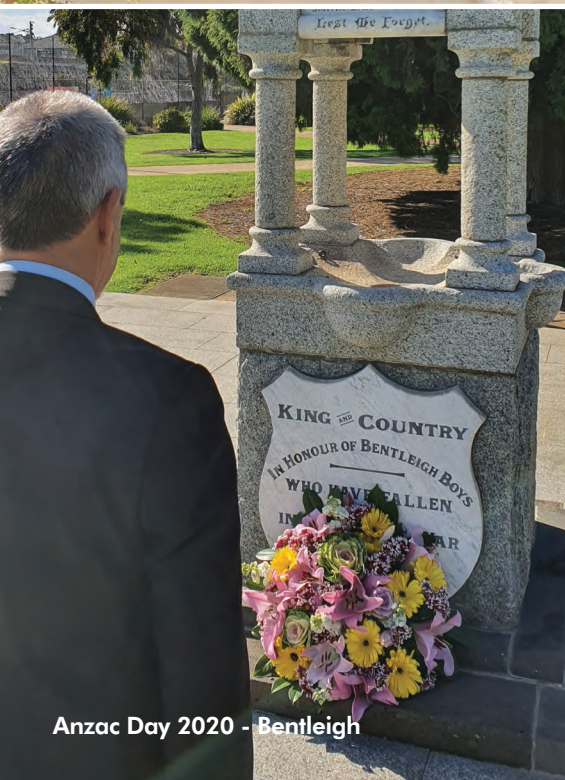
Anzac Day 2020 - Bentleigh